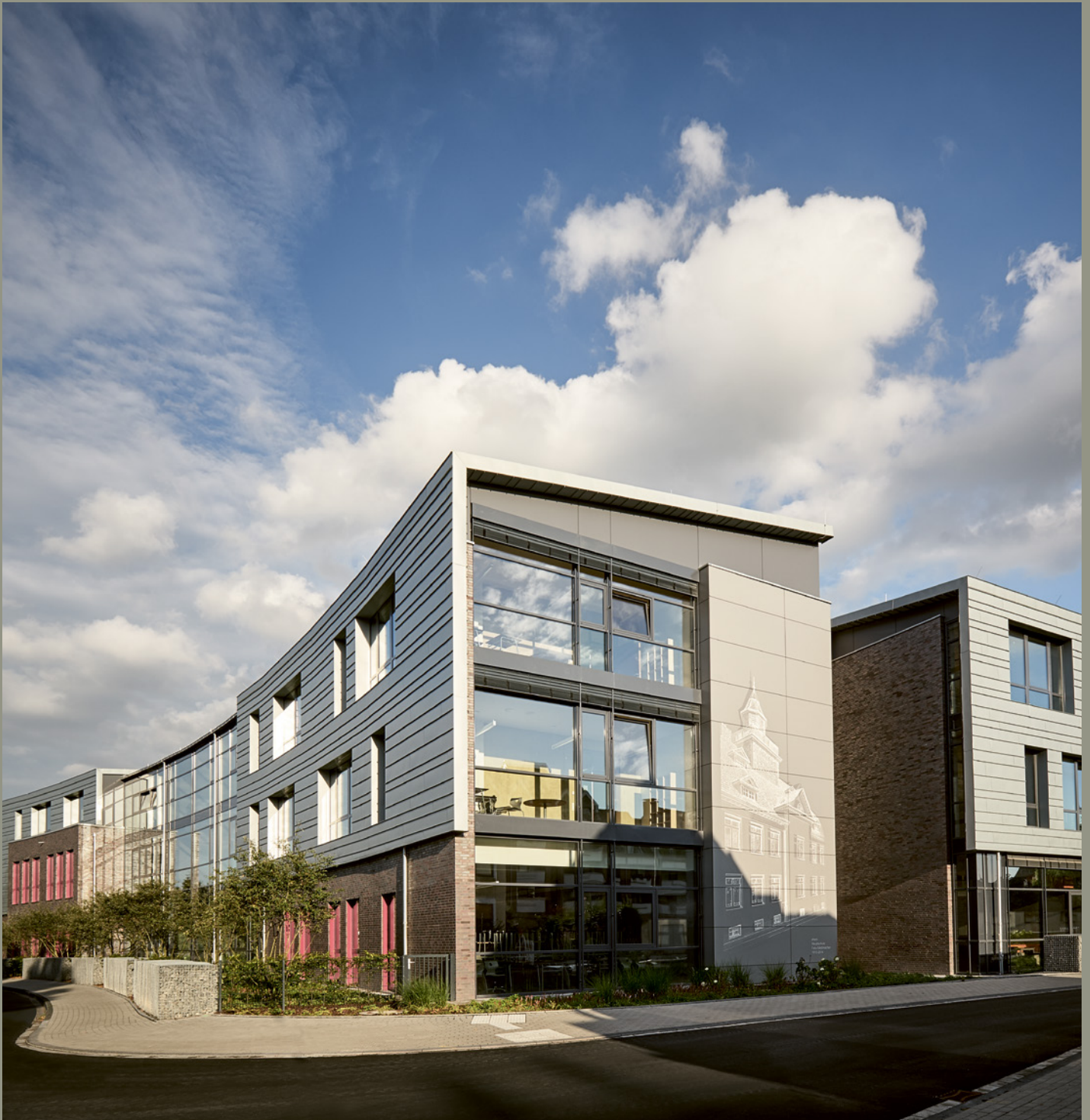
MUNICIPAL COMPREHENSIVE SCHOOL LANGENFELD