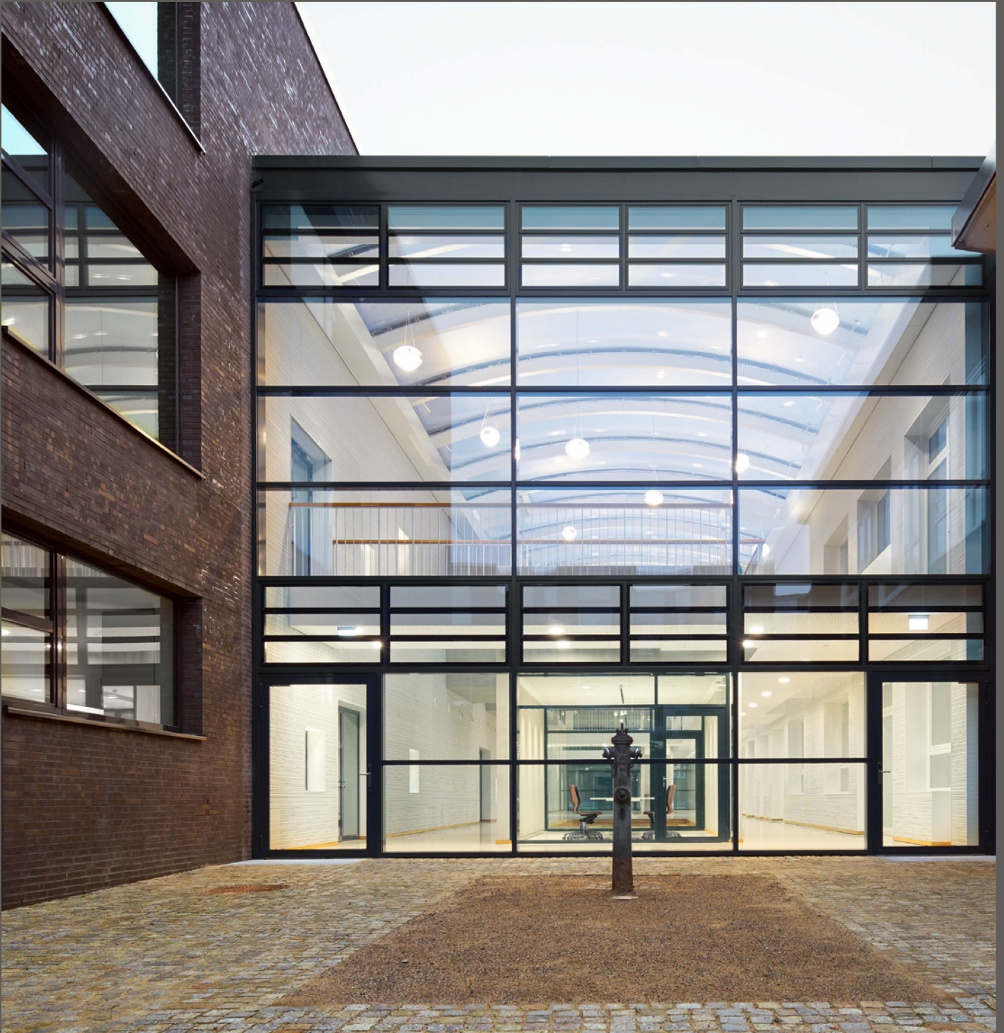
ST. PAULUS SCHOOL, HAMBURG