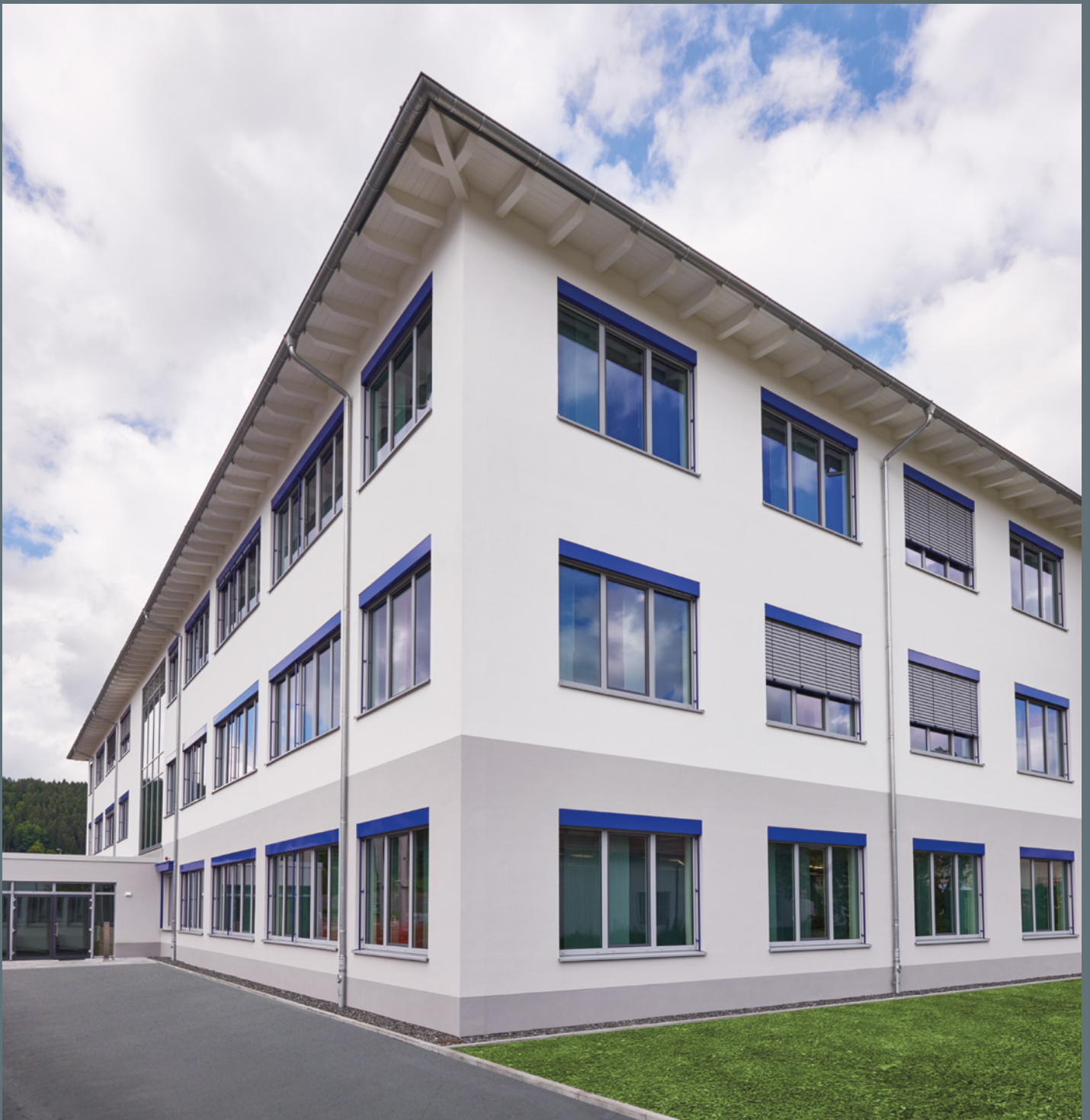
DR. SCHNEIDER R&D CENTRE, KRONACH